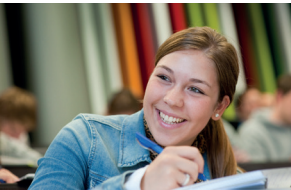
Student in lecture hall 13, New University building, Campus in the Old Town

FACULTY OF PHILOSOPHY The subjects of the Faculty of Philosophy explore culture in its various manifestations and in its spatial differentiation – from the earliest traces of human civilisation to the current day. The faculty has a strong research orientation and also offers international master's degree programmes.