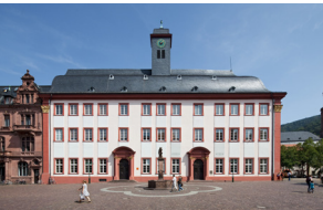
Old University, seat of the rectorate and central venue for events at Heidelberg University

THE UNIVERSITY Heidelberg University is a classical, research-oriented, comprehensive university. The range of subjects comprises the humanities and social sciences, law, the natural and life sciences and medicine.