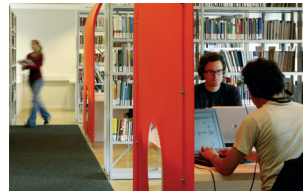
Library, Bergheim Campus