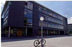
Kirchhoff Institute for Physics (KIP), Im Neuenheimer Feld Campus

The master's programme provides a solid foundation for the graduate's entry into the professional world or for a scientific career.