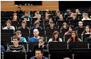
The twelve faculties of Heidelberg University offer around 80 different master's programmes.

Entrance requirements Admission to master's degree programmes is restricted; entrance requirements vary among programmes. We differentiate between consecutive and advanced master's programmes. Consecutive programmes are the most common type. These are programmes in which the bachelor's programme is immediately followed by the master's programme. Advanced master's programmes require students to have at least one year of professional work experience. The advanced master's programmes are subject to special fees.