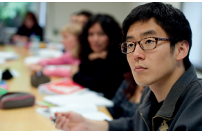
Some of the master's programmes are taught partly or entirely in English.

MEDICAL FACULTY HEIDELBERG The Medical Faculty in Heidelberg enjoys great international renown and attracts students, teachers and researchers from all over the world. In addition to human medicine and dentistry, the faculty