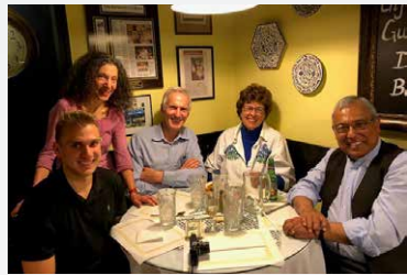
Northern California alumni at Café Marika in Sacramento

Heidelberg University Presented at the Germany Grad Fair in May