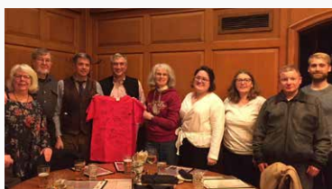
Chicago alumni with the famous HAUS T-Shirt!