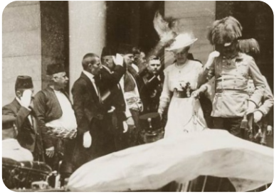
- in 1914 was the site of assassination of Franz Ferdinand, heir presumptive to the Austro-Hungarian Empire, whose death led to the start of World War I