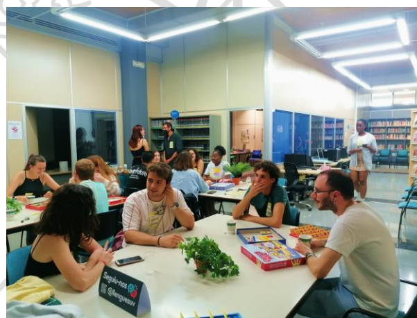
One of our language learning centres