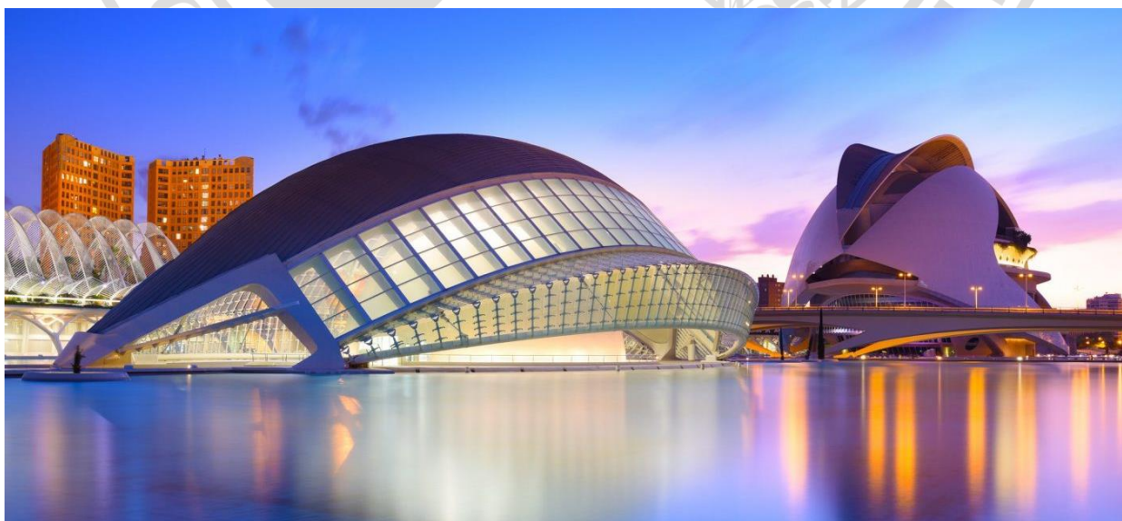
The City of Arts and Sciences, one of the many attractions in the city of Valencia

Applications welcome at any time. For the deadline, please consult the coordinators of each language.