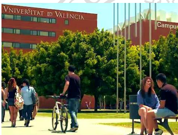
One of our three campuses