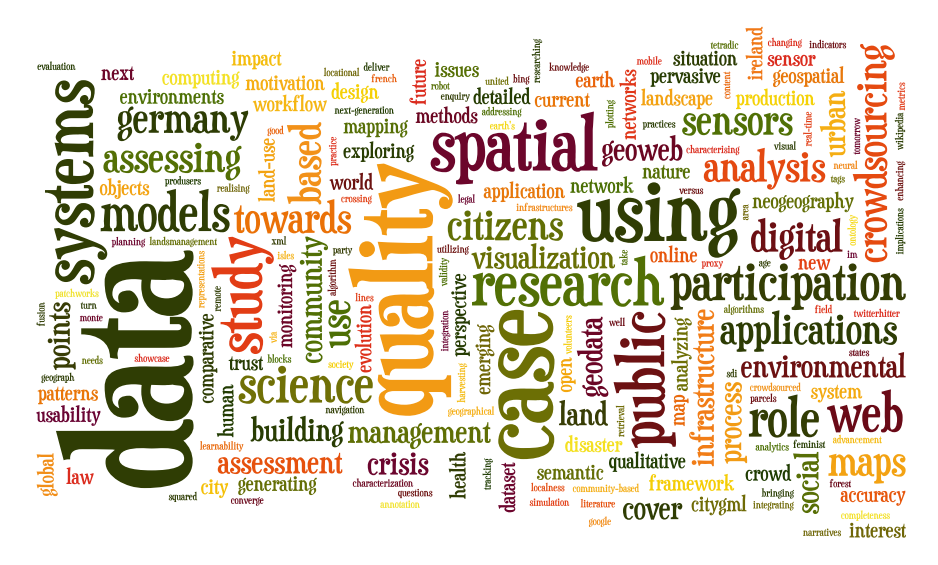
Fig. 1 Word cloud of the papers' titles

impression about common words and show the number of times a certain word appeared in the literature. This is expressed by varying font sizes. Larger font sizes refer to words that appear more often than smaller font sizes (Helbich et al. 2013). It should be noted that the aforementioned search terms were removed from the resulting word cloud as their usage frequencies were substantial and masked the other terms. We leave these figures for the readers to interpret them visually and gain some insights about the research on OSM so far.