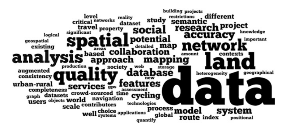
Fig. 4 Word cloud of our chapters' abstracts

The word cloud in Fig. 3 displays the most frequently occurring terms in the abstracts of the papers returned in our Google Scholar searches. Quality is a dominant term but we see the concepts of research, social, community, methods, and development emerging. There are obvious visual linkages to the word cloud in Fig. 4 where the abstracts of the chapters included in this volume are visualized.