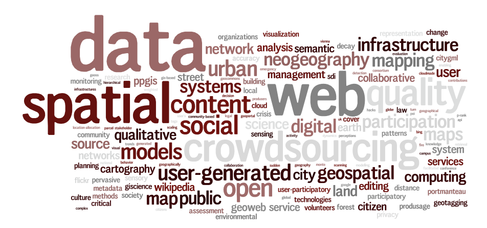
Fig. 2 Word cloud of the papers' keywords

As editors of this volume, we have been involved in research connected to OpenStreetMap for many years. From our own empirical experience, these word