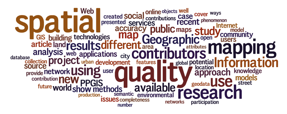
Fig. 3 Word cloud of the papers' abstracts

clouds capture the essence of academic research on OpenStreetMap from the past number of years. In Figs. 1 and 2 where the word clouds of paper title terms and keywords are presented we see a few dominant terms, particularly data , quality , research , systems , and participation . As we mentioned earlier, the issue of the quality of OSM data has been on the research agenda for many years now. It is likely to remain on the agenda for some time to come. However, these titles also reflect the expansion of OSM research to consider the citizen and volunteer participation, which drives the expansion of the project. The systems, models, sensors, and applications which collect, analyze, store, manage, transform, and distribute the data must now be studied and explored in more detail as OpenStreetMap grows in size potentially towards being considered as Geographic Big Data (Goodchild 2013).