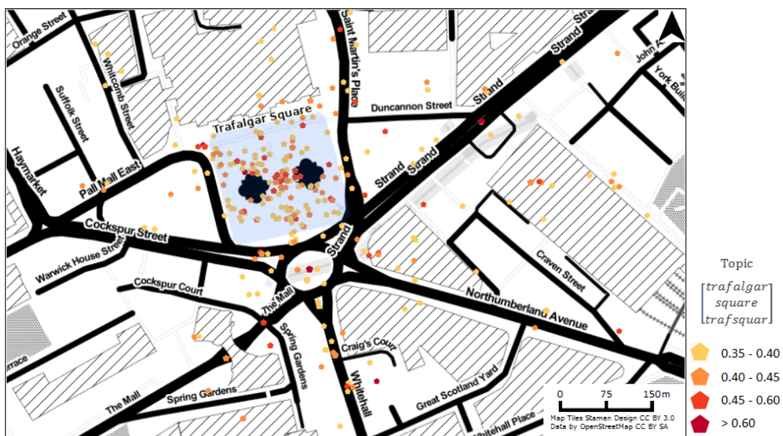
Figure 1: LDA topic association indicator for words “trafalgar” and “square” over all topic related filtered georeferenced tweets in London (n = 3796).

All tweets are collected in real-time through the official Twitter streaming API ( https://dev.twitter.com/docs/api/streaming ). The semantic tweet content from every user is then preprocessed to remove whitespaces, punctuations and numbers. In the next step all tweet corpora from Twitter undergo a natural language processing step by applying tokenization, stemming and stop word filtering (Lewis et al. 2004). We are using latent dirichlet allocation (LDA) as one semantic probability based topic extraction model introduced by Blei et al. (2003). The unsupervised machine learning model identifies latent topics and corresponding word clusters from our large collection of tweets. This technique reduces the semantic dimensions and works efficiently especially on large unseen datasets. It is a sophisticated method compared to arbitrary simple keyword filtering techniques which have limited scalability. Figure 2 shows an exemplary LDA probabilistic topic extraction visualization for the highest assignments ( >0.3 ) for the topic associated words “trafalgar” and “square”. The words “photo”, “london” and “england” also appear and show lower topic assignments ( <0.3 ). As a result, high density areas of topic relevant classified tweets are closer to the real world object Trafalgar Square.