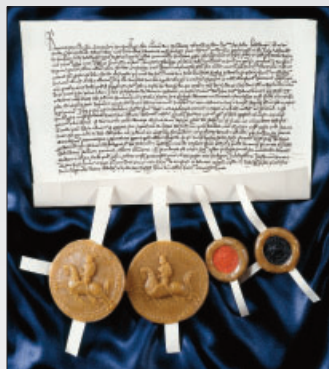
The charter of the University (replica)