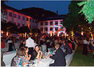
University Summer Night 2008